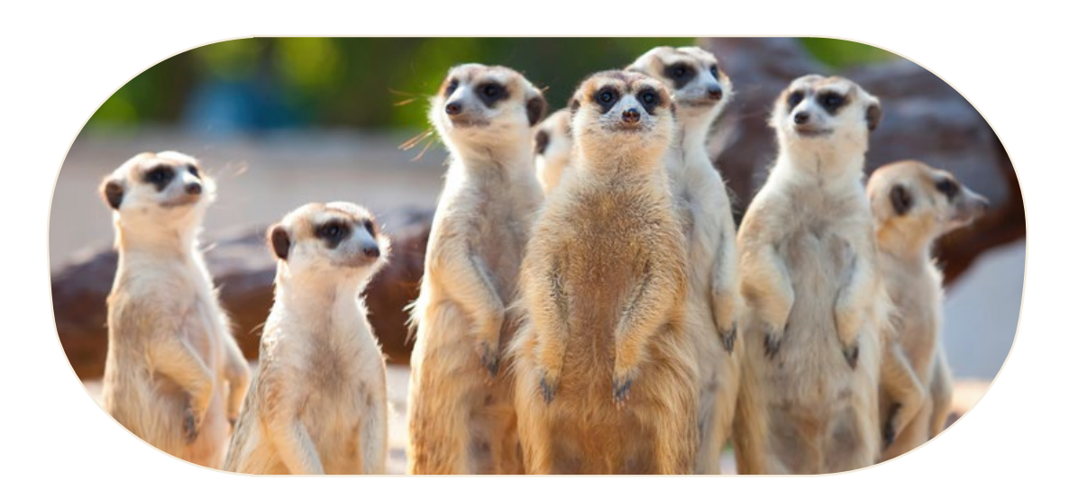
Few things are more powerful, says GetUp's Kelsey Cooke, than a group of individuals working towards a shared vision.

power of a torrent of calls from voters in an MP's local area, especially on an issue that's garnering a lot of media coverage.