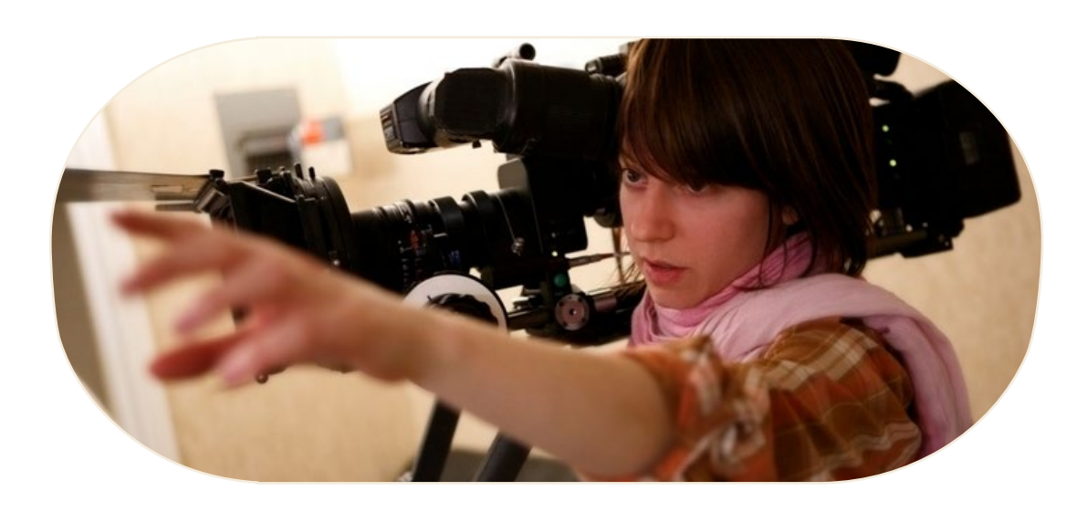
Not-for-profits need to be able to tell a story, says former broadcaster Lynne Haultain.