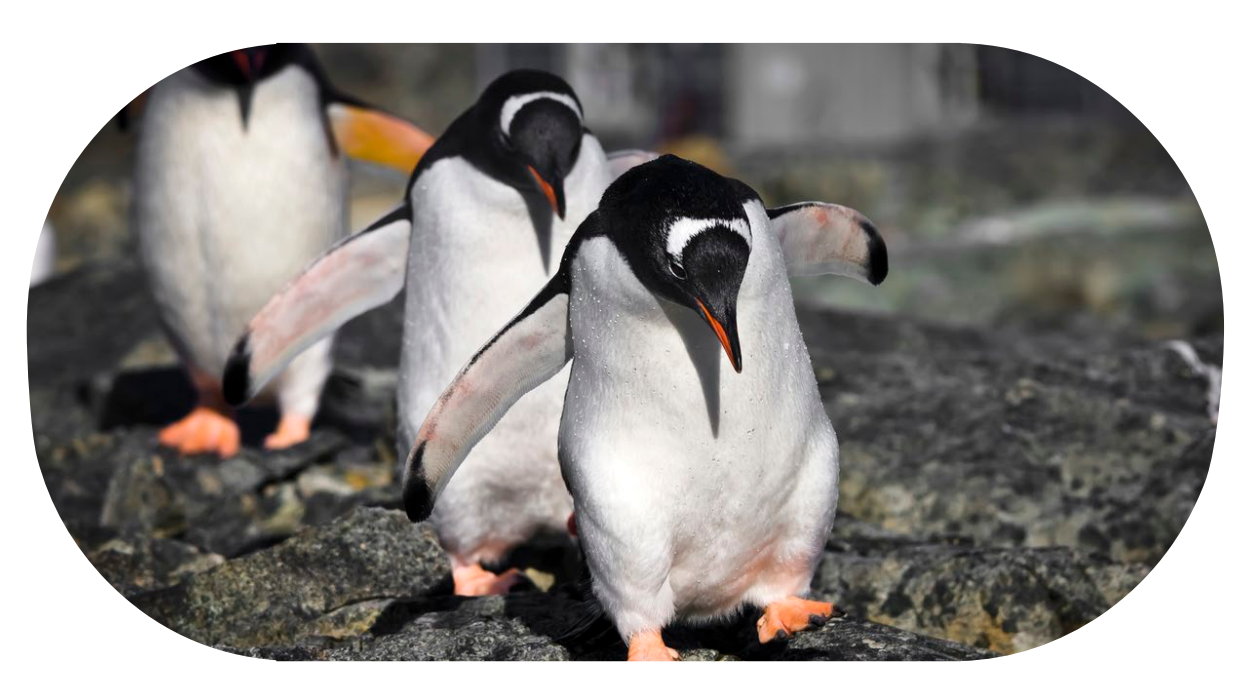
"Not-for-profit leaders need to lead by example, which is no different from the animal kingdom," says Michelle Jenkins.