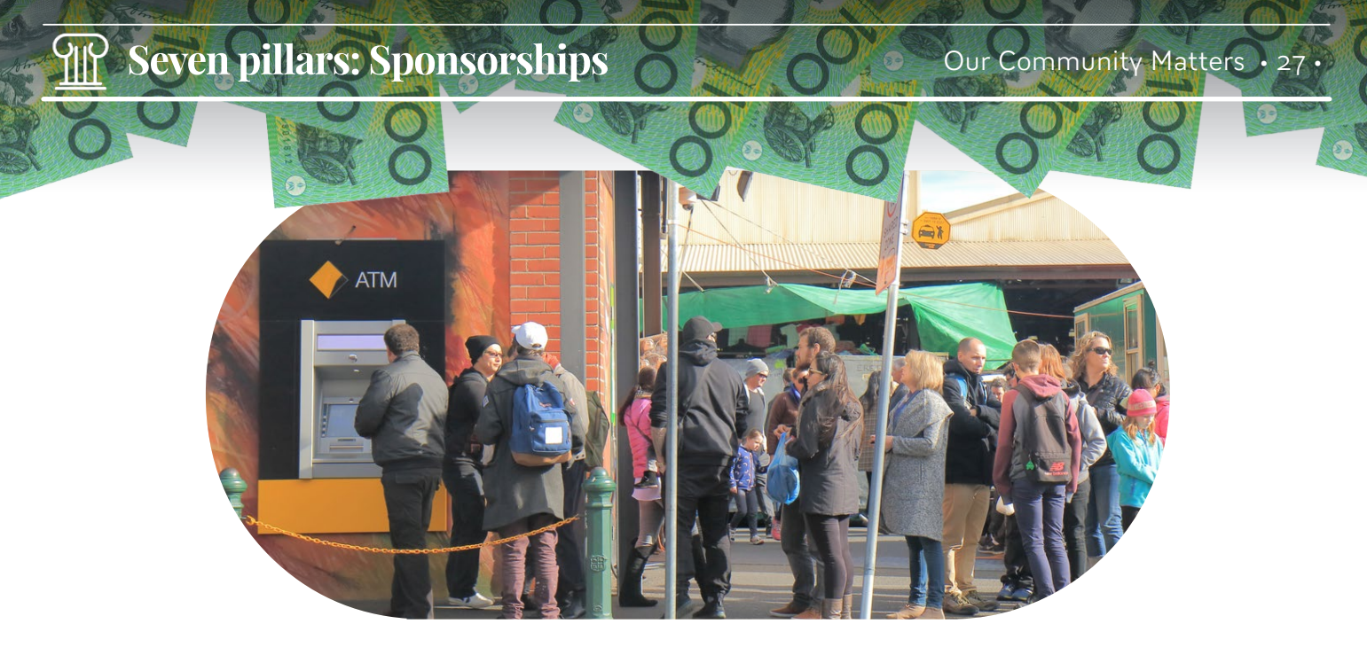
Don't treat potential sponsors like cash machines. The most successful deals benefit both the sponsor and the not-for-profit involved.